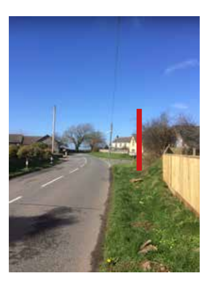
<<< Proposal in Burton