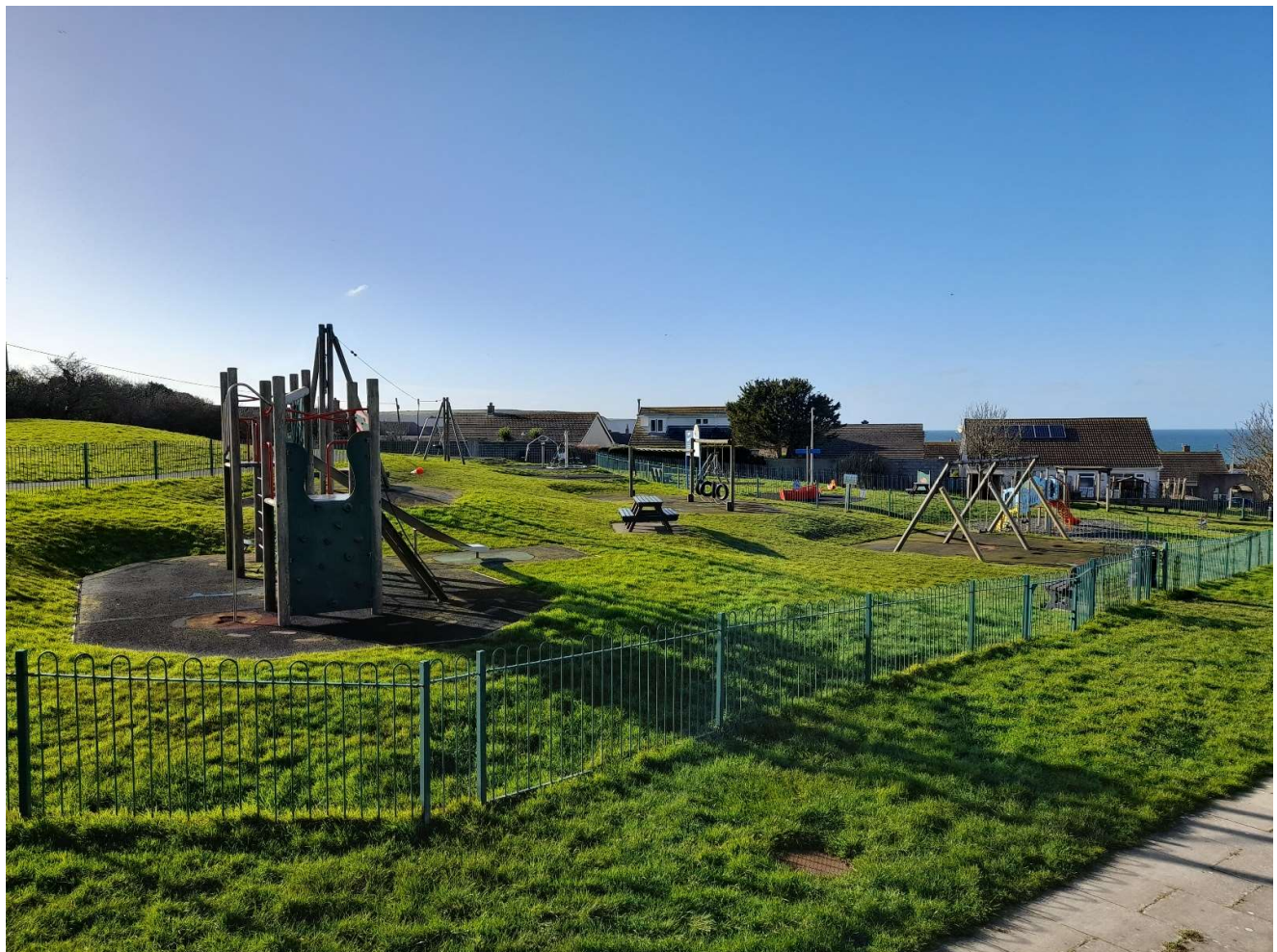
Broad Haven Play Park

HCC's objective is to recognise a duty to be responsive to the needs of all who live in the Havens by helping to build a resilient, healthy and sustainable environment.