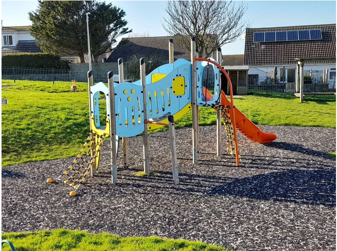
The Little Hamlet, Broad Haven

Finishing touches were also added to the Hamlet play equipment during the year – a project which was started in 2021 following a substantial donation from The Havens Carnival Committee.